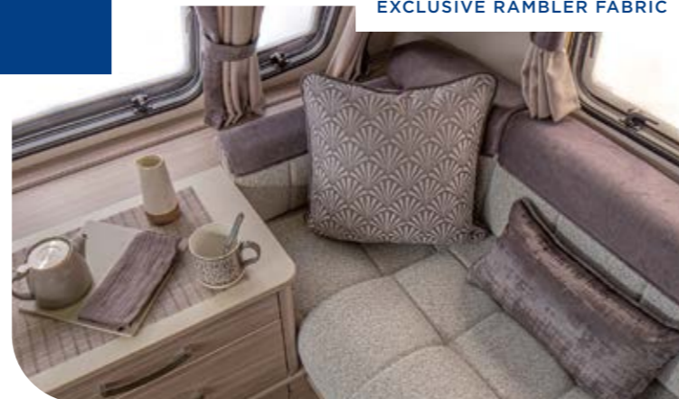
EXCLUSIVE RAMBLER FABRIC