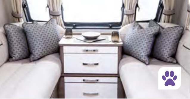
STANDARD: ROCOCO PETFRIENDLY FABRIC UPHOLSTERY

PetFriendly Technology Buccaneer standard Rococo and optional Elysée and Eden fabrics are also designed to be pet friendly. Fabric has anti-allergen technology and is anti-snag – keeping your Buccaneer looking its best!