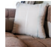
Tia' upholstery standard in Autoquest