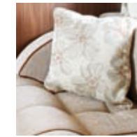
'Botanique' Aquaclean® upholstery as standard

FREE‡ £999 £420 £1,499 £299 £249 £149 £649 £899 £1,099 £499 £1,199 £249 FREE‡ £199 £40