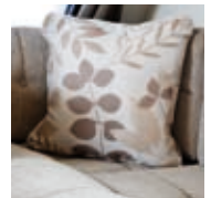
Optional 'Assina' Aquaclean® upholstery