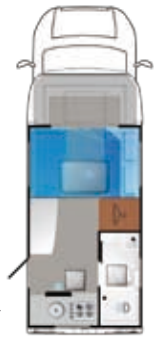
Aspire 215 £43,899

Elddis is the only manufacturer to ensure that the number of berths is matched by the number of seatbelts