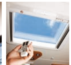
Heki 4 remote controlled rain-sensitive rooflight

The Mass in Running Order includes a tolerance for material variances and an allowance for the driver, a full tank of fuel, 90% of the water tank and the gas bottles and the auxiliary battery. Maximum User Payload includes: Personal Effects, Optional Equipment and the Conventional Load. Note 1: Please take care to ensure that you have allowed for the masses of all items you intend to carry in the motorhome. Note 2: Warning under no circumstances must the Maximum Technical Permissible Laden Mass of the motorhome be exceeded. Note 3: All data is calculated using metric weights and measurements. The imperial figures quoted are conversions thereof. Note 4: Care should be taken when loading your motorhome in order to ensure that you do not exceed either the front or rear axle maximum weight Note 5: If used as single beds rather than a double bed, single bed measurements in the 215 are calculated incorporating usage of the front driver and passengers seats. Note 6: The double bed in the 240 is measured with the chest of drawers removed. Note 7: The maximum height is increased by 100mm when the optional awning is fitted. Note 8: All Aspire Motorhomes have a fresh and waste water tank capacity of 90 Litres.