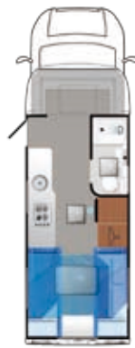
Aspire 240 £48,999