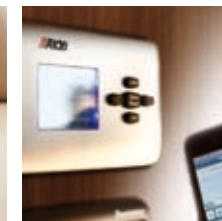
ALDE telemetric control to central heating (mobile phone connectivity via SMS)