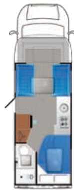
Aspire 255 £48,999