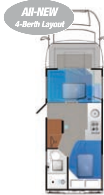
Aspire 265 £49,999