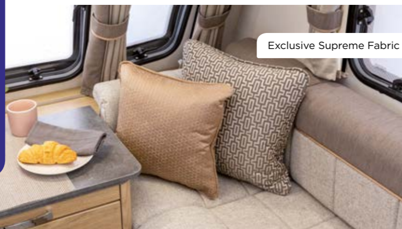
Exclusive Supreme Fabric